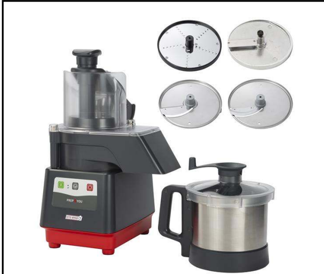
602301 (DCOM26PD4US) Combined Vegetable Slicer and Cutter Mixer 2.6LT/2.8 qt, with transparent copolyester bowl, single speed, dicing discs included: grater 2mm, slicer 4mm, aluminium slicer 10mm, grid 10X10mm, grid cleaning tool, NEMA 5-15P plug-Eurodib